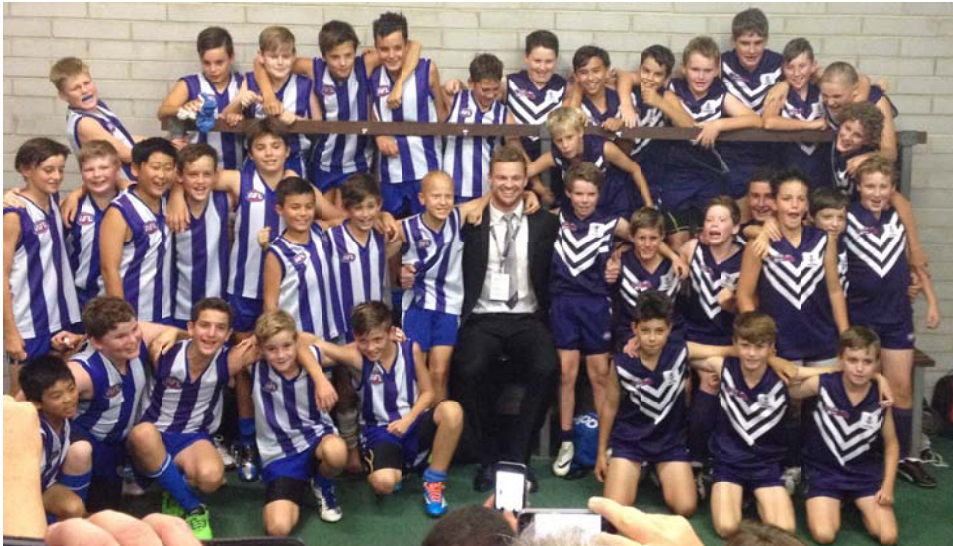
Year 7 representing North Melbourne in the Little League

In a show of how close and committed this team has become there was 9 milestone games during the year with another 5 due next season. Well done to all players !